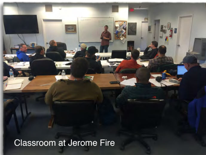
Classroom at Jerome Fire

Be ready for a great week and it will surely be challenging! You will learn a lot and walk away with heaps of knowledge.