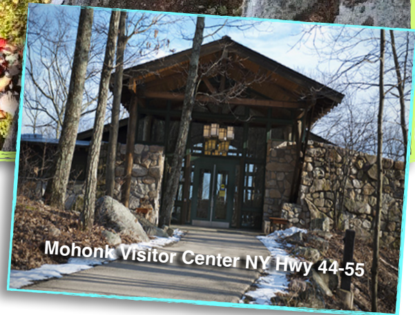
Mohonk Visitor Center NY Hwy 44-55

944-7723 for any equipment needs with a discount for RTR. Rock and Snow (New Paltz) also gives great discounts to RTR students. Be sure to mention the workshop.