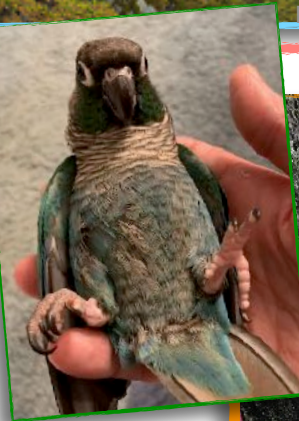
Sequoia, the Green Cheek Conure