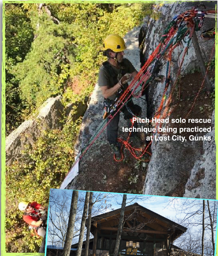
Pitch Head solo rescue technique being practiced at Lost City, Gunks